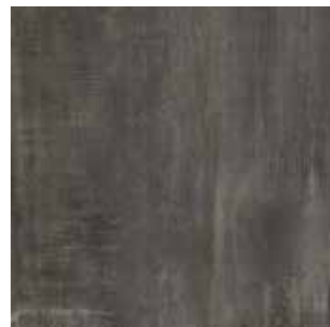
60X60 CM - 24"X24" RETT. 107392 ALUMINIUM ■ 105