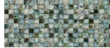
26X60,5 CM - 10,2"X23,8" 113070 FASCIA VERNICE ● 87