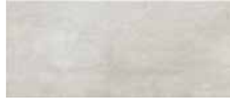
26X60,5 CM - 10,2"X23,8" 111383 DOVE ■ 88