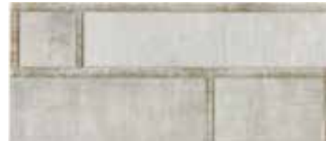
26X60,5 CM - 10,2"X23,8" 111389 INDUSTRIAL PLATINUM ■ 112