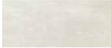
26X60,5 CM - 10,2"X23,8" 111382 SHALE ■ 88