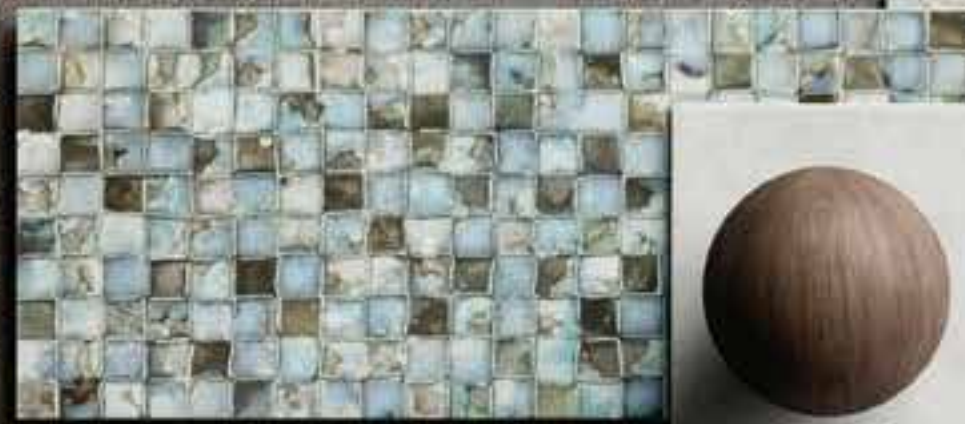
26X60,5 CM - 10,2"X23,8" DOVE