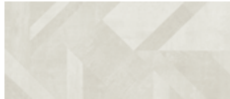
26X60,5 CM - 10,2"X23,8" 111387 ALLMIX ■ 112