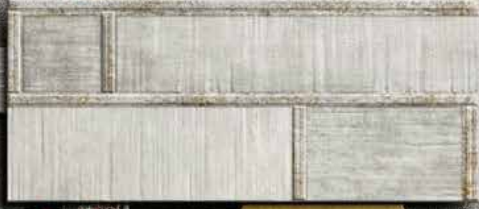
8,5X60,5 CM - 3,3"X23,8" TAVELLA DOVE