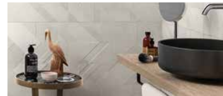
SHALE . MOSAICO LUMIERE . ALLMIX PAV - PLATINUM