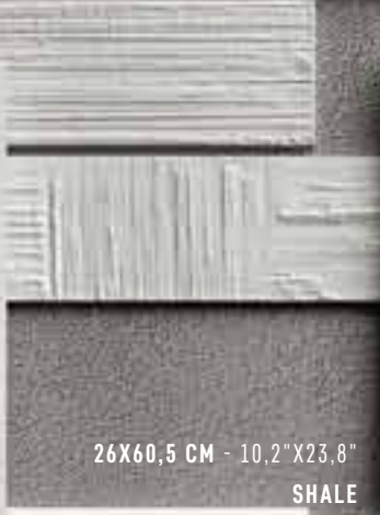
26X60,5 CM - 10,2"X23,8" SHALE