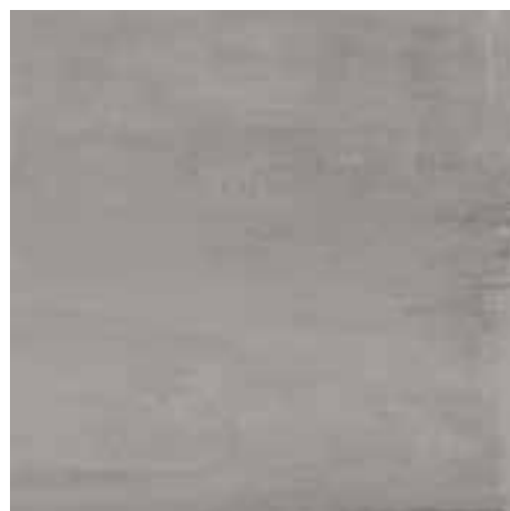
60X60 CM - 24"X24" RETT. 107393 PLATINUM ■ 105