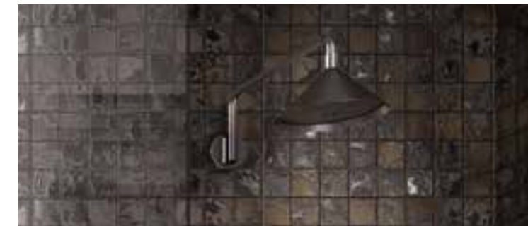
DOVE . TAVELLA DOVE . FASCIA PATCH MIX . MOSAICO LUMIERE PAV - PLATINUM