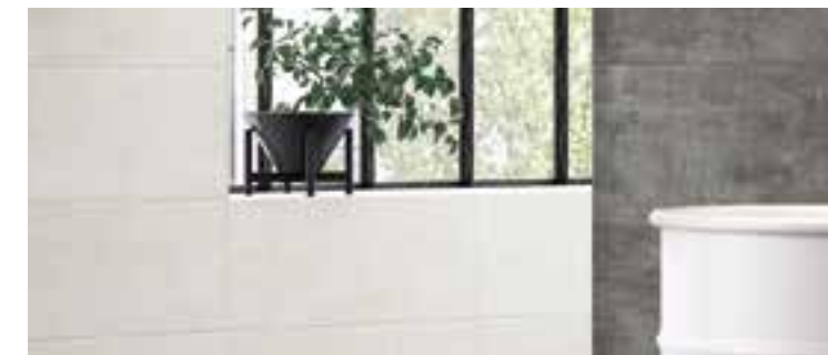
COKE . SHALE . FASCIA VERNICE PAV - PLATINUM