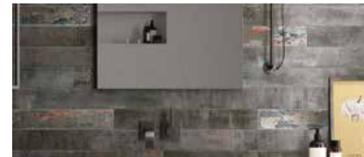
SHALE . TAVELLA COKE . LISTELLO MIX HEMATITE INDUSTRIAL ALUMINIUM . PAV - ALUMINIUM