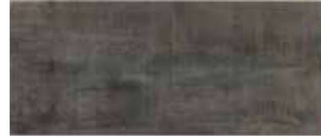
26X60,5 CM - 10,2"X23,8" 111386 COKE ■ 94