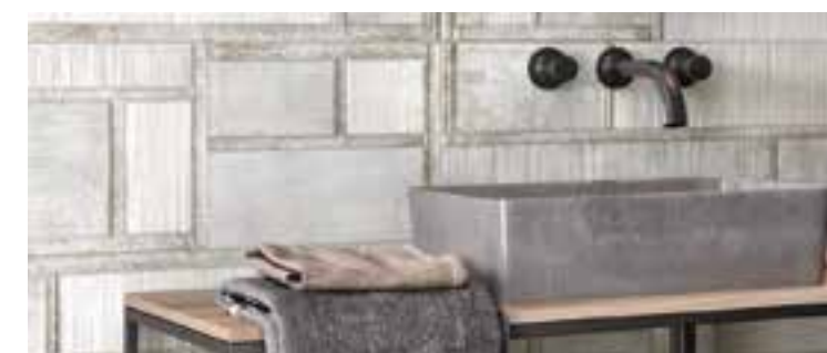
INDUSTRIAL PLATINUM . TAVELLA DOVE PAV - ALUMINIUM