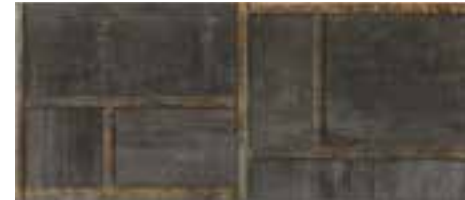
8,5X60,5 CM - 3,3"X23,8" 113062 TAVELLA COKE ■ 149