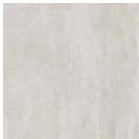
60X60 CM - 24"X24" RETT. 107395 INDIUM ■ 105