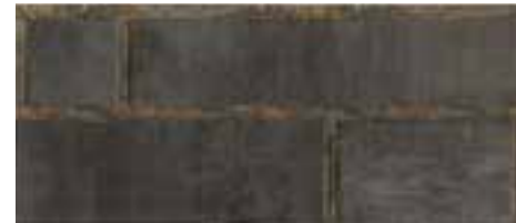
26X60,5 CM - 10,2"X23,8" 111388 INDUSTRIAL ALUMINIUM ■ 112