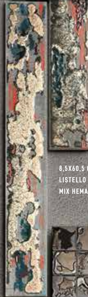
8,5X60,5 CM - 3,3"X23,8" LISTELLO MIX HEMATITE